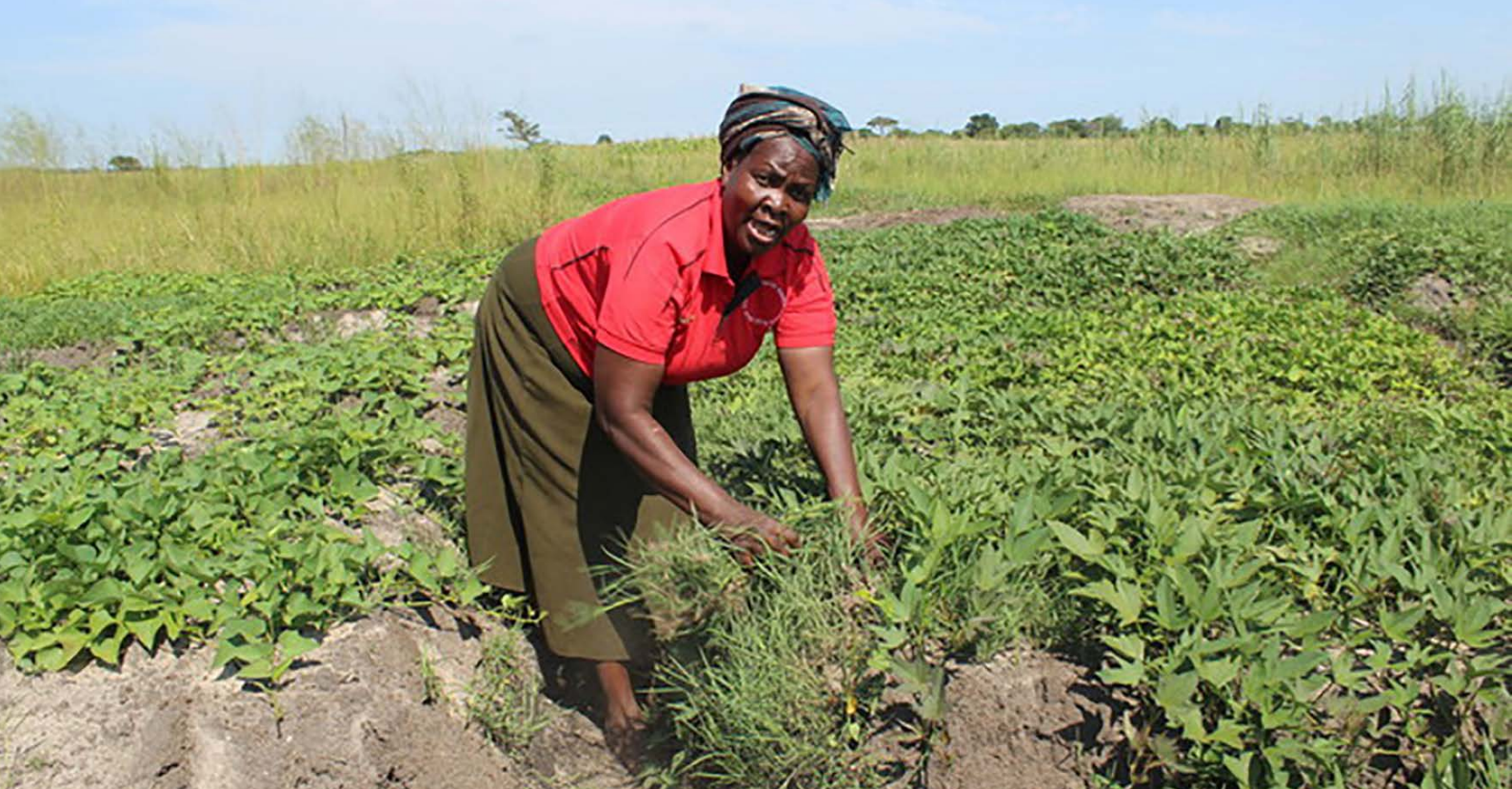
Practicing adaptation measures for sustainable production and productivity.