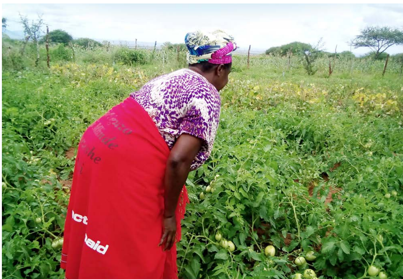
Bountiful harvest of tomatoes from the vegetable garden, as a source of income during the pandemic.