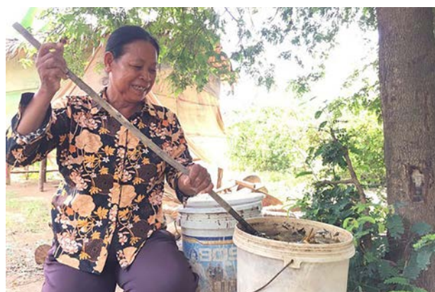
Production of biopesticide using local resources to grow healthy vegetables for her family and to sell.

A farmer from Tanzania emphasised the pivotal importance of soil mapping. "The Government uses a lot of money to import fertilizer without checking what nutrients lack from the soil – this affects productivity."