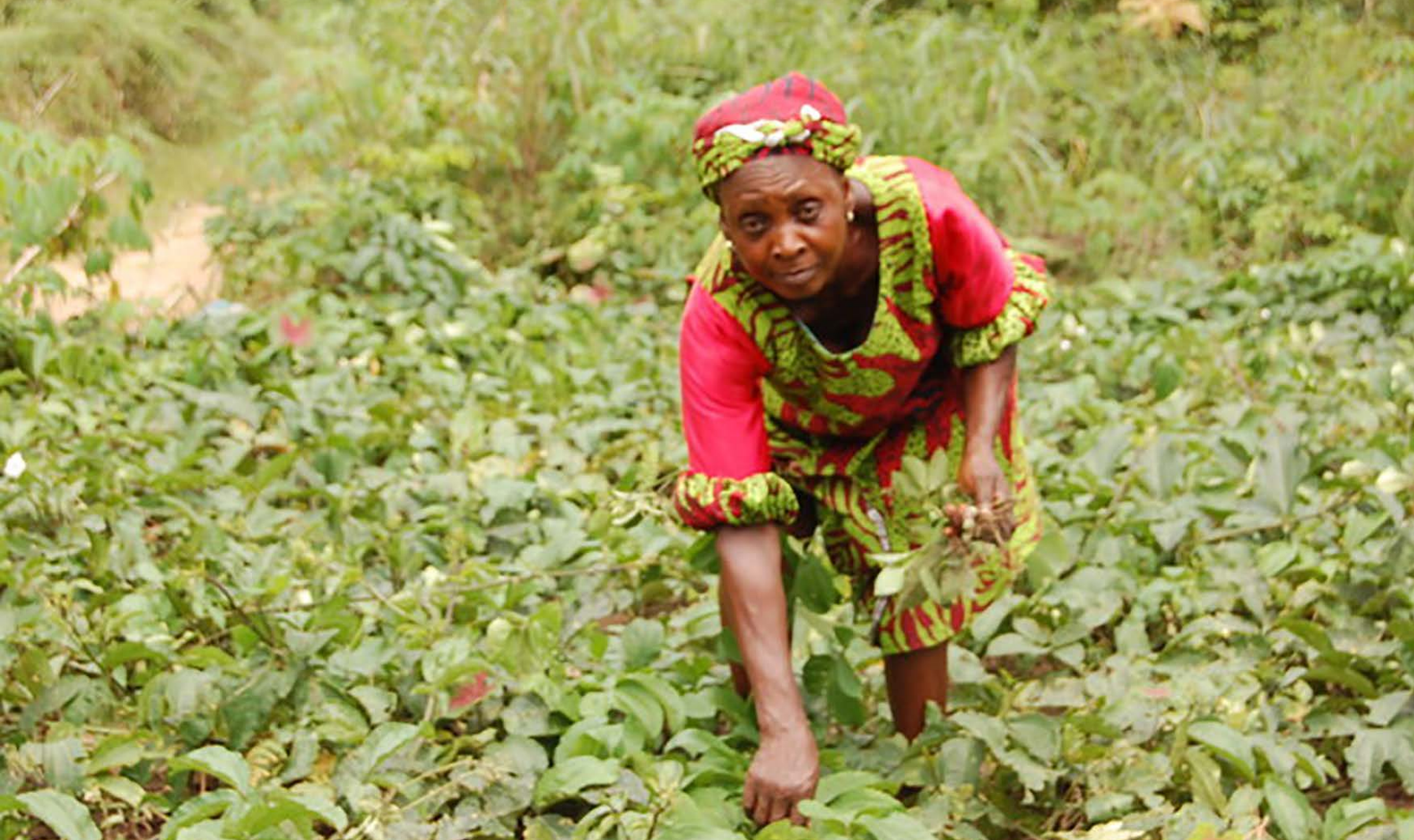
Farming on the farm allocated by village council where she has made good sales particularly during the pandemic as people were still buying food.