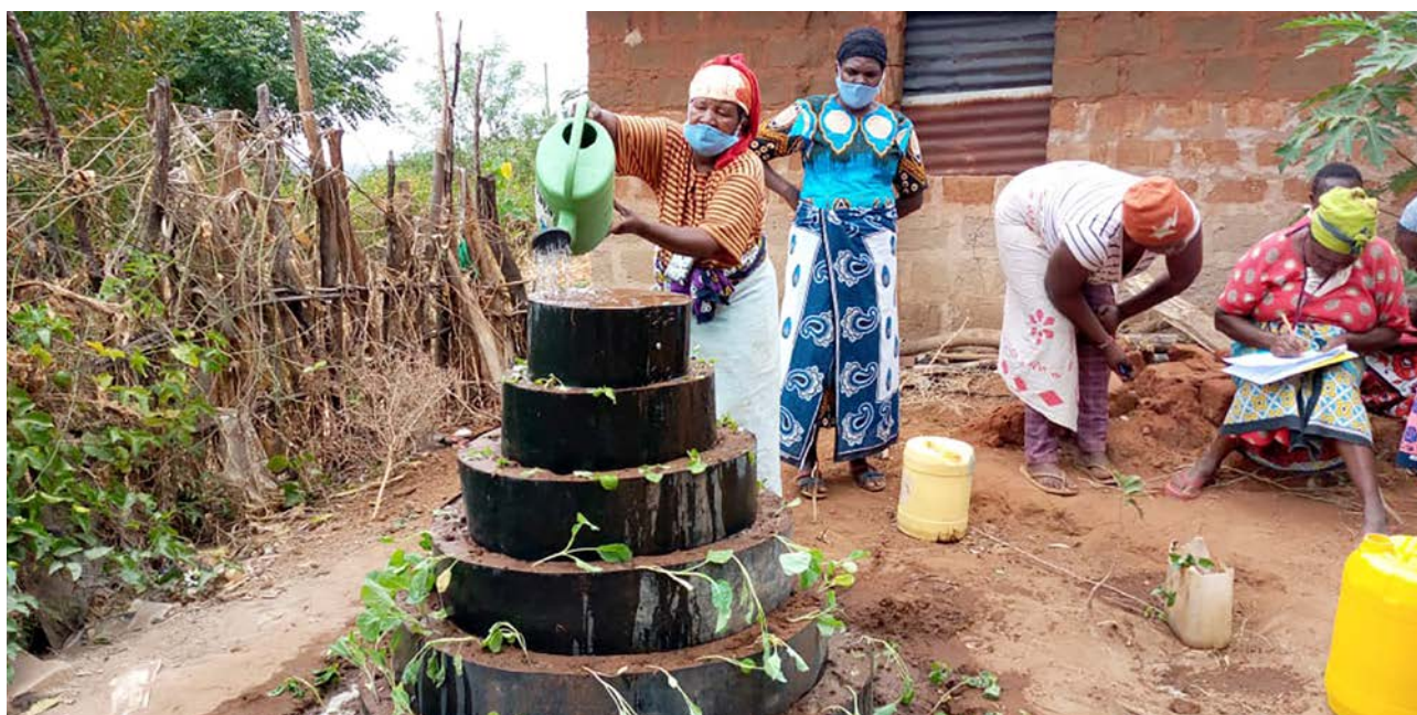
Women training on how to nurture their kitchen garden, an important fallback for food security during Covid 19 Crisis.

In the review process, opportunities and strategies to cope with the impacts of Covid-19 were examined for each of the five thematic areas.